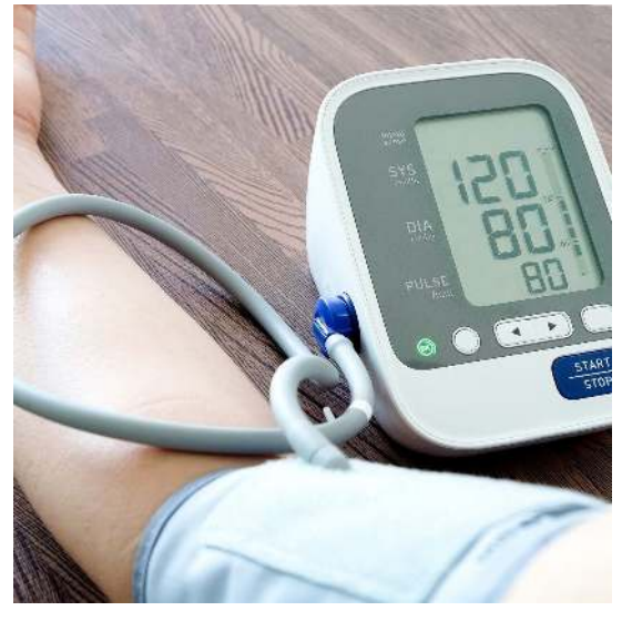
Things like that.

You can grow. And the way we do that is thinking about these foundational outcome measures, like neuroplasticity, your ability to improve your memory, your ability to improve your attention.